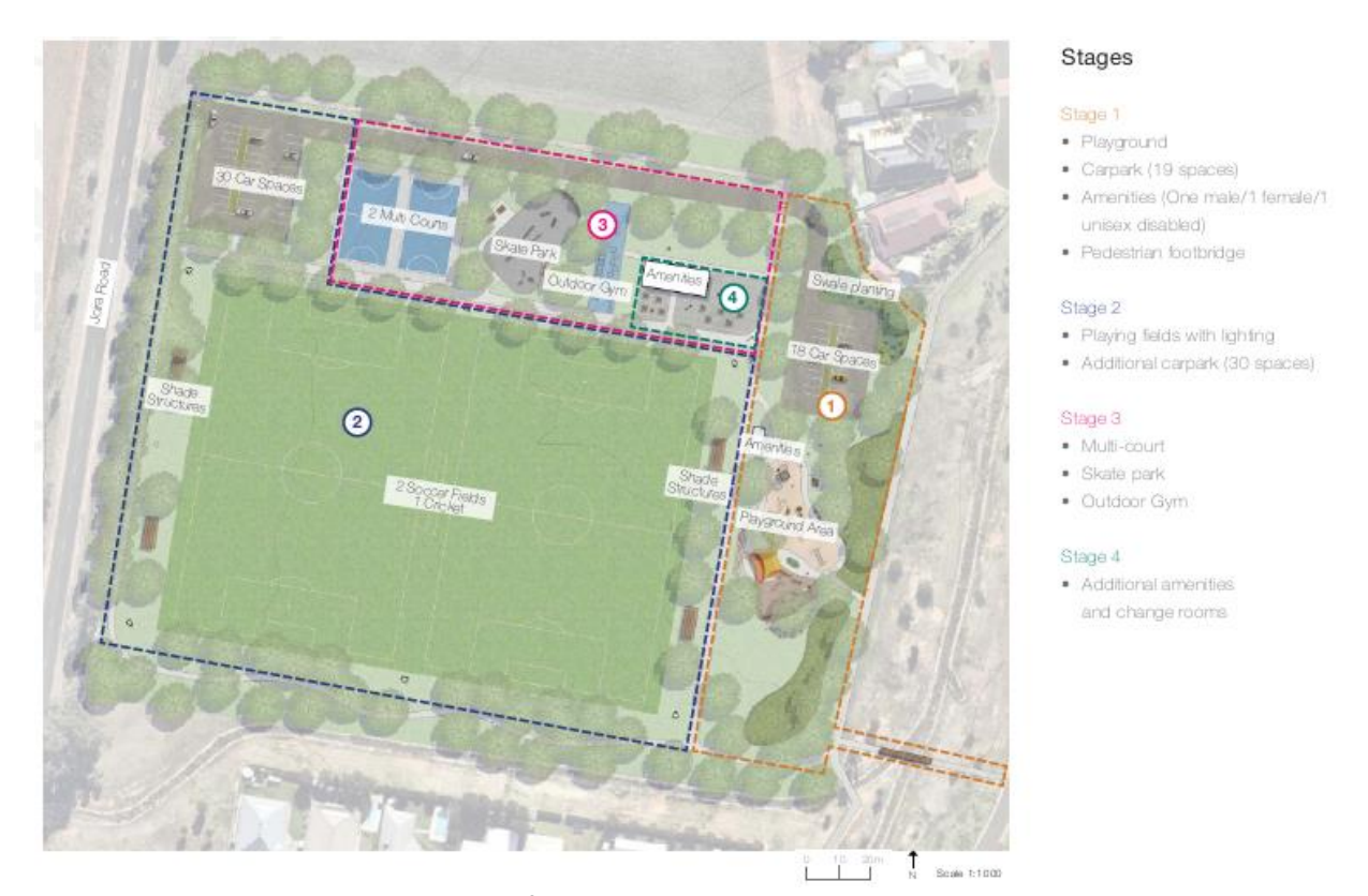
Figure 3. Staged implementation plan for the Delroy Parklands Recreational Precinct.