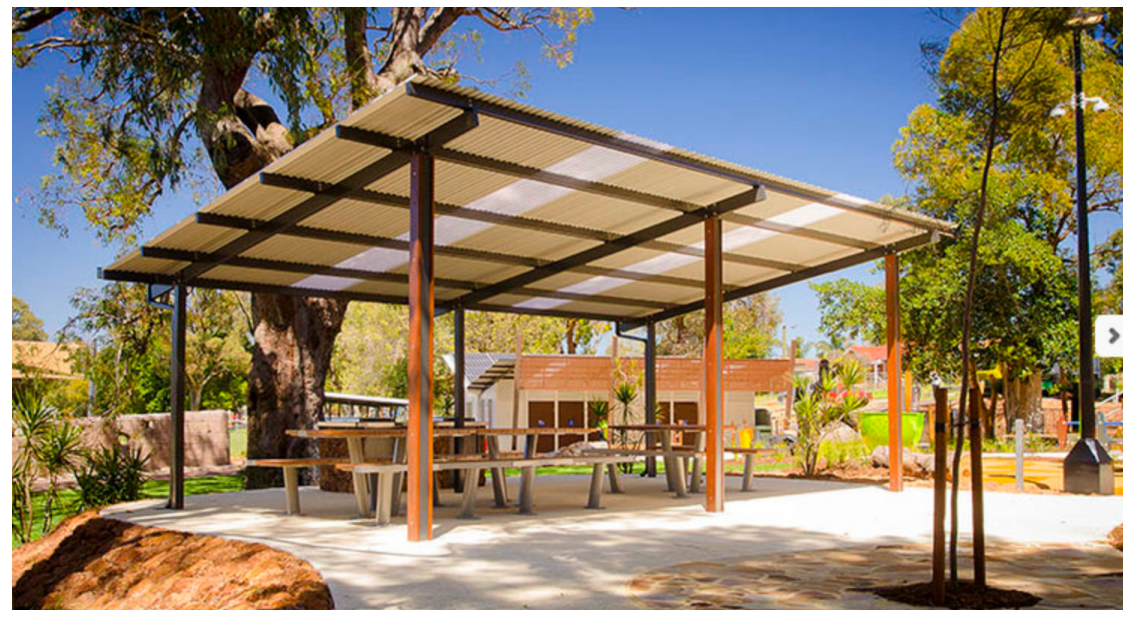
Dubbo Regional Council - Delroy Parklands Recreational Precinct 7