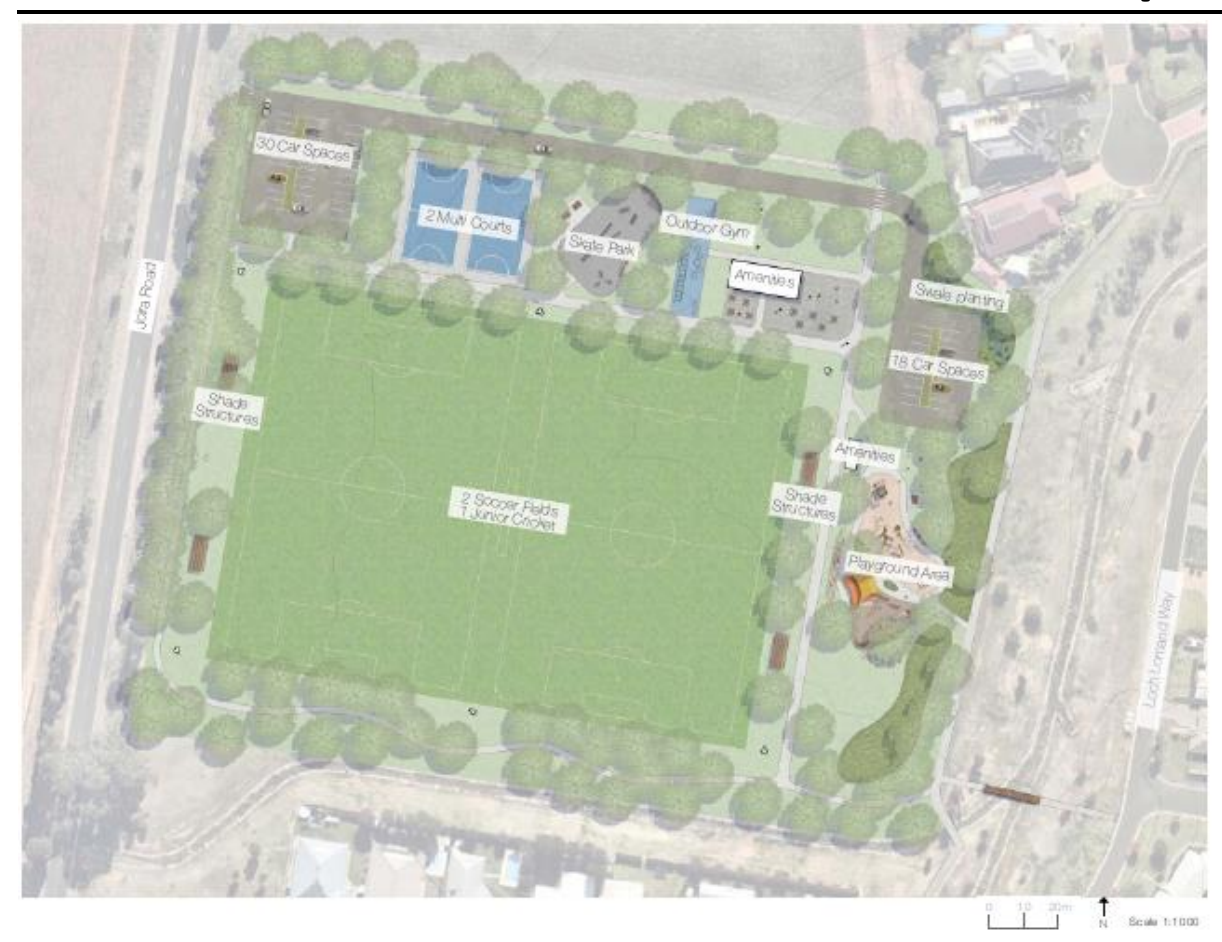
Figure 2. Delroy Parkland Recreational Precinct.