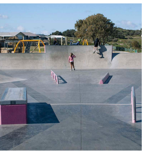
Dubbo Regional Council - Delroy Parklands Recreational Precinct 10