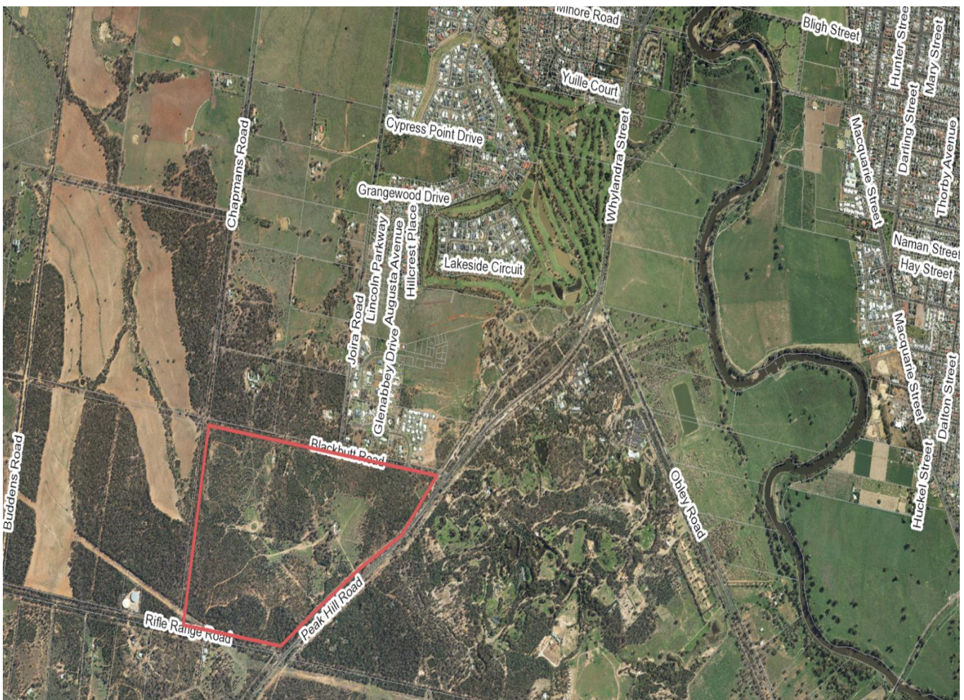
Figure 3. Lot 172 DP 753233, 20R Peak Hill Road, Dubbo

The allotment is located in south-west Dubbo and is boarded by Blackbutt Road to the north, Rifle Range Road to the south, Chapmans Road to the west and Peak Hill Road (Newell Highway) to the east. The site has an area of 98.14 hectares as shown in Figure 3 .