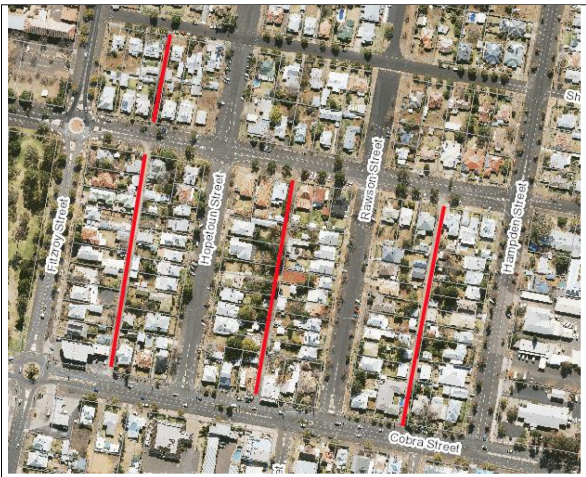
Figure 2: Location of unnamed laneways highlighted in red

Keeping with the theme of Governors of New South Wales, it is recommended that the laneways be named as follows: