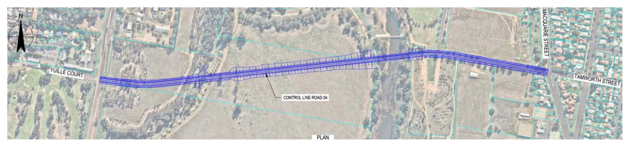
Figure 3 – Option 3, identified as Option D in the GHD Dubbo South New Bridge Strategic Concept Design Report , attached as Appendix 3 . Provides a connection from Whylandra Street at the Dubbo Golf Club driveway on the west, to Macquarie Street at the Tamworth Street intersection on the east. Estimated cost $32,050,800.