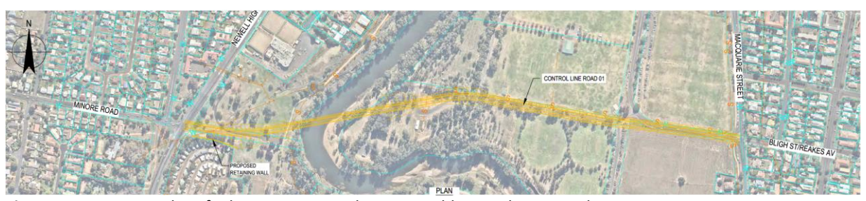
Figure 1 – Option 1, identified as Option A in the GHD Dubbo South New Bridge Strategic Concept Design Report , attached as Appendix 3 . Provides a connection from Whylandra Street at the Minore Road intersection on the west, to Macquarie Street at the Bligh Street and Reakes Avenue intersection on the east. Estimated cost $41,402,300.