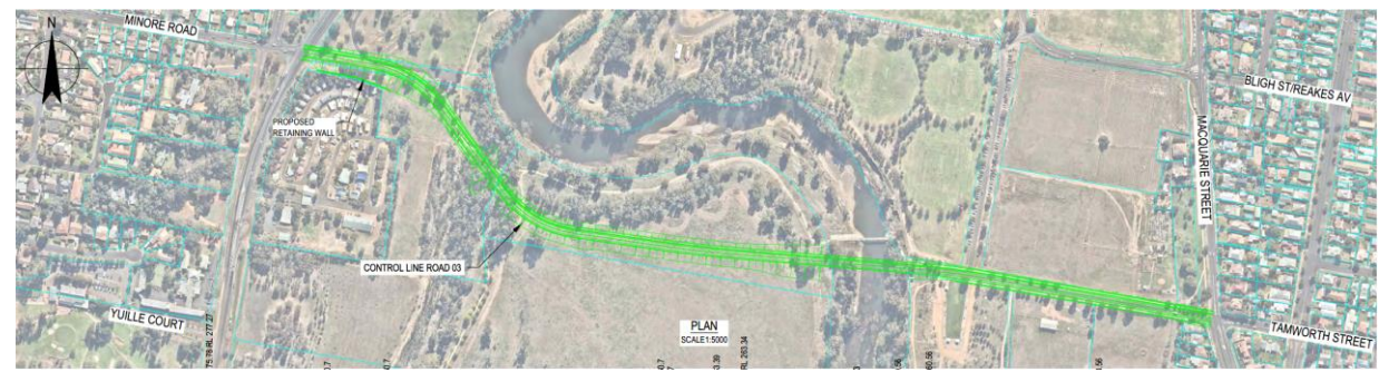
Figure 2 – Option 2, identified as Option C in the GHD Dubbo South New Bridge Strategic Concept Design Report , attached as Appendix 3 . Provides a connection from Whylandra Street at the Minore Road intersection on the west, to Macquarie Street at the Tamworth Street intersection on the east. Estimated cost $39,049,900.