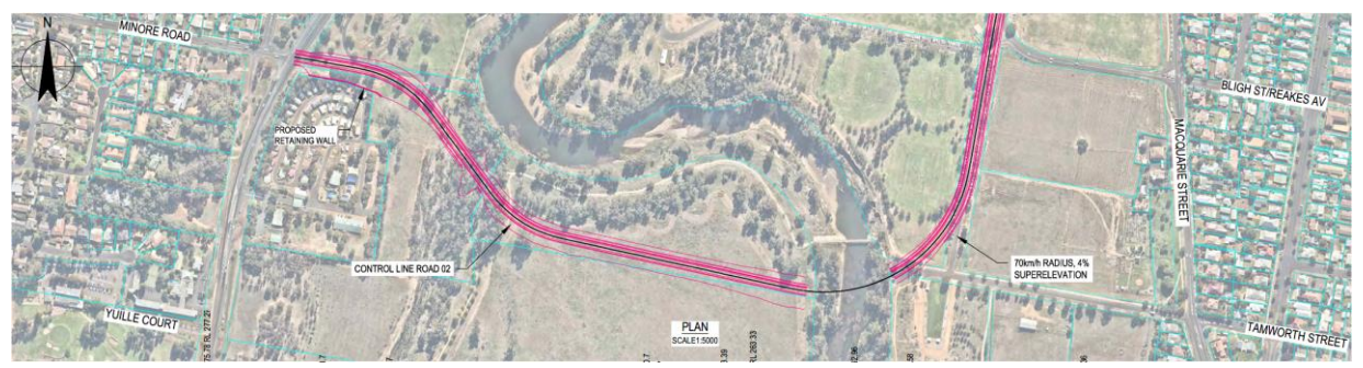
Figure 4 – Option 4, identified as Option B in the GHD Dubbo South New Bridge Strategic Concept Design Report , attached as Appendix 3 . Provides a connection from Whylandra Street at the Minore Road intersection on the west, to Bligh Street at the South Street and Sandy Beach Road intersection on the east. Estimated cost $35,693,900.