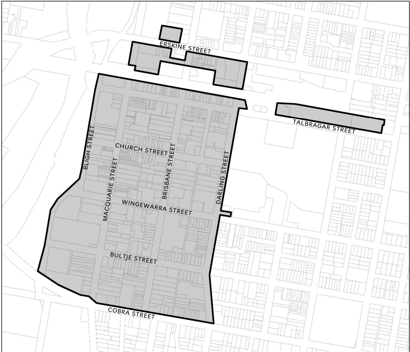
Figure 1. Dubbo CBD Precinct