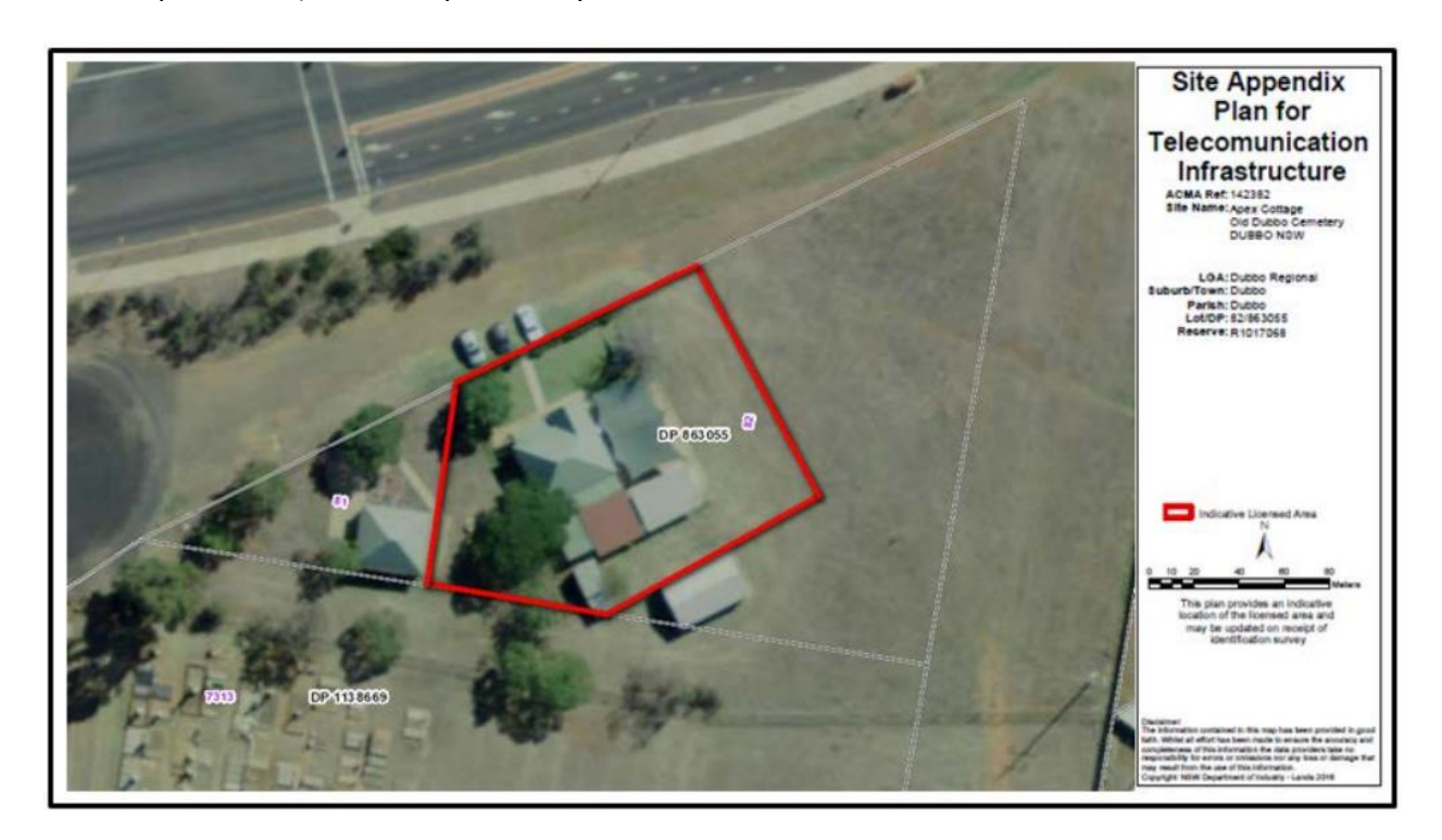
Image 2: The portion within the Red boundary is covered by the Telecommunications Licence with Crown Lands.