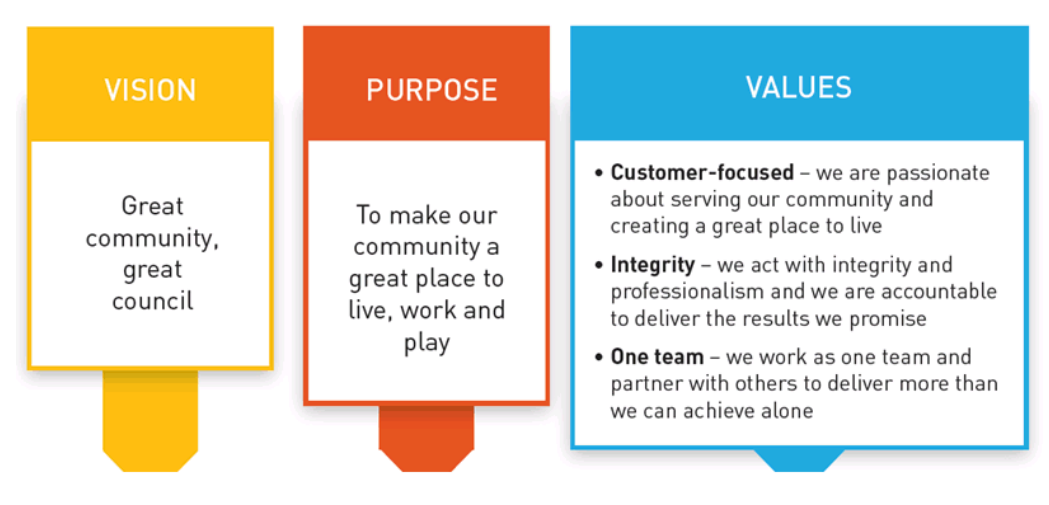
Figure 1: Council's Vision, Purpose and Values

The key implications for the organisation structure from the vision, purpose and values are to: