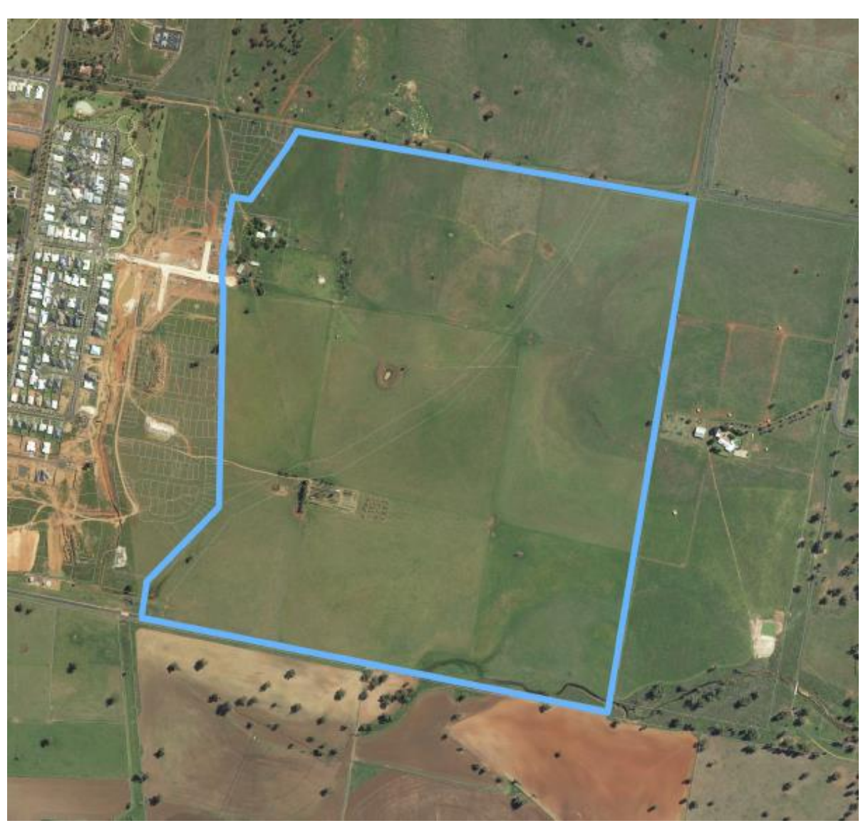
Figure 1. Subject site - Lot 399 DP 1199356, Lot 12 DP 1207280 and Lot 503 DP 1152321, Boundary Road, Dubbo

The subject site is currently zoned R2 Low Density Residential with a component of the land zoned RE1 Public Recreation along the existing drainage corridor which traverses the site from north-east to the south-west under the provisions of the Dubbo Local Environmental Plan 2011. The subject land currently has a minimum lot size of 600 m² and 4,000 m² along the Hennessy Road boundary.