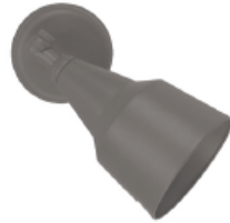
(a) One light fitting