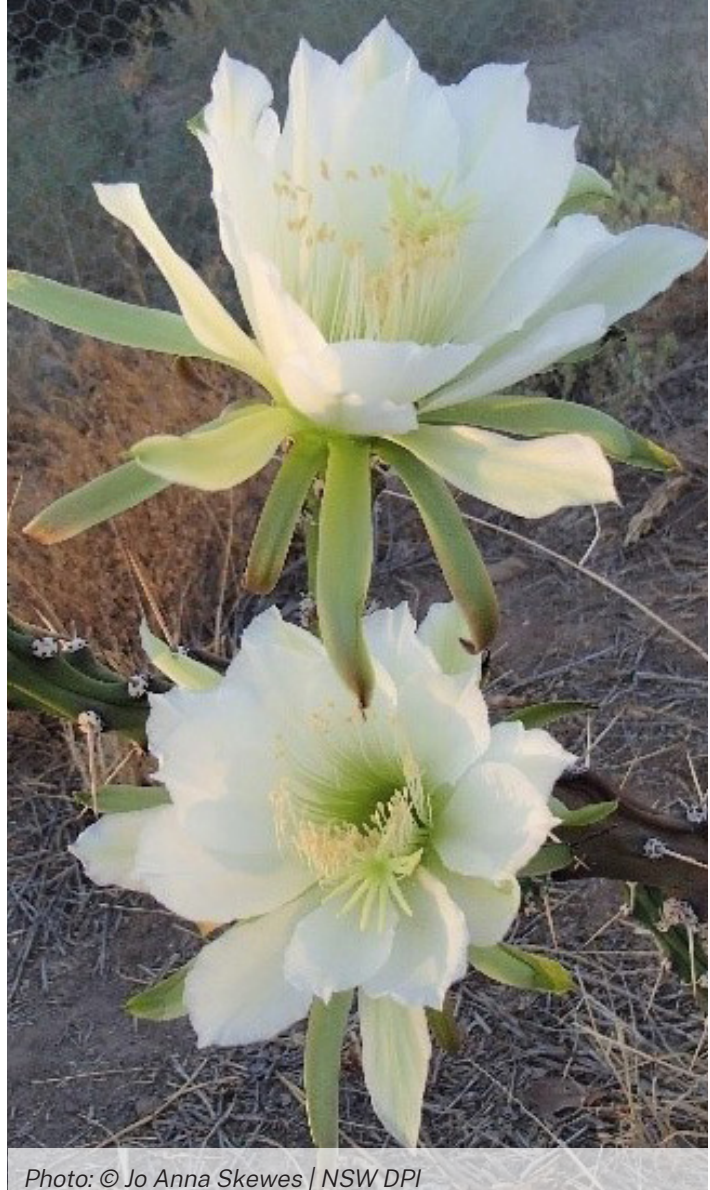
Harrisia (Harrisia spp.)